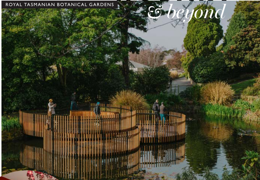
ROYAL TASMANIAN BOTANICAL GARDENS

The epic 8.8-mile Hobart to the Pinnacle walk climbs 3937 feet from HOBBART RIVULET , through the city, behind the historic CASCADE BREWERY and into the bushland and fern-filled creek gullies of WELLINGTON PARK . You'll be rewarded with wildlife sightings and great views. greaterhobarttrails.com.au