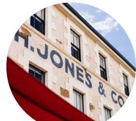
HENRY JONES ART HOTEL