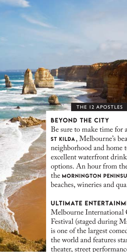
THE 12 APOSTLES