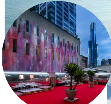
A UNIQUE STAY