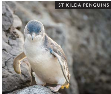
ST KILDA PENGUINS

SEE THE ST KILDA PENGUINS: St Kilda is home to a colony of around 1400 little penguins; catch a glimpse of them every day just after sunset at the end of the pier. stkildapenguins.com.au