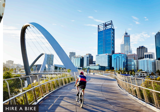
HIRE A BIKE