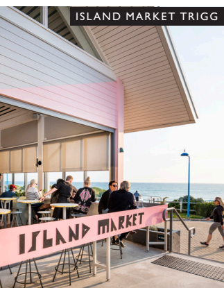
ISLAND MARKET TRIGG

SEE THE JOURNEY OF THE PEARL, FROM HARVEST TO SHOWROOM, IN THE HEART OF THE CITY BY VISITING THE WILLIE CREEK PEARLS SHOWROOM AT ELIZABETH QUAY. WILLIECREEKPEARLS.COM.AU