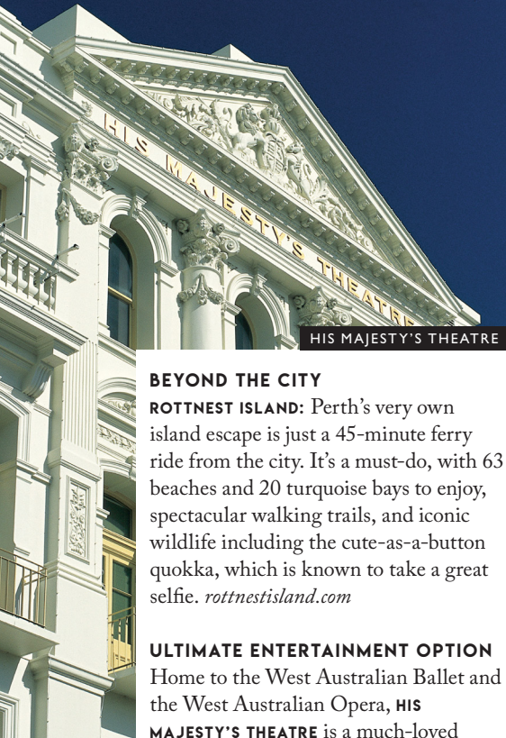
HIS MAJESTY'S THEATRE