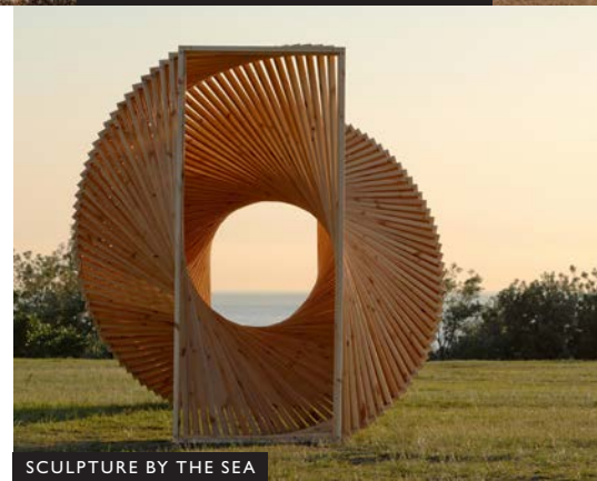
SCULPTURE BY THE SEA