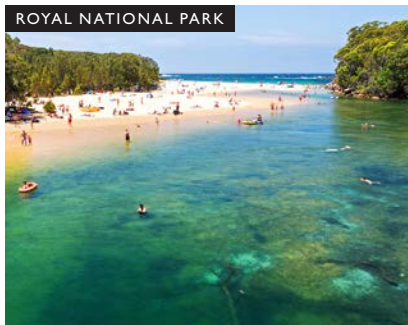
ROYAL NATIONAL PARK

Lycra-clad locals flock to the BONDI to BRONTE walk, which snakes along the headlands between the two beachside suburbs, providing stunning views all the way. Visit during SCULPTURE BY THE SEA when the route becomes an outdoor exhibition space for 100 sculptures by Australian and international artists. sculpturebythesea.com/bondi