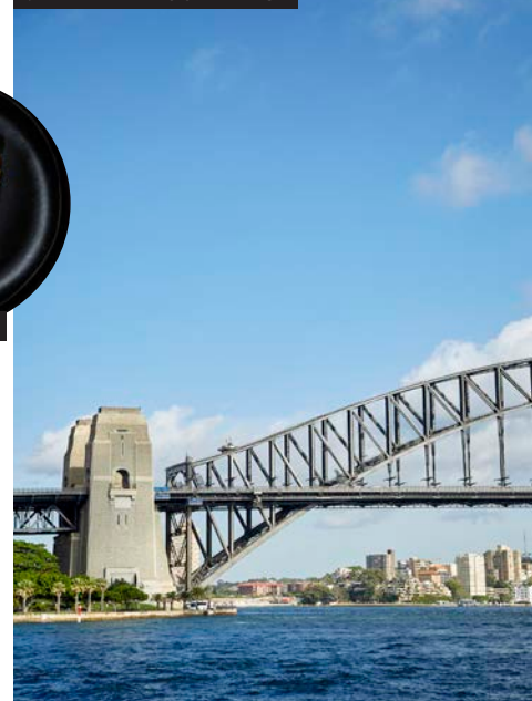
SYDNEY HARBOUR BRIDGE

Housed in a heritage wool store, this boutique hotel respects the building's history while still managing to feel seriously hip. ovolohotels.com.au